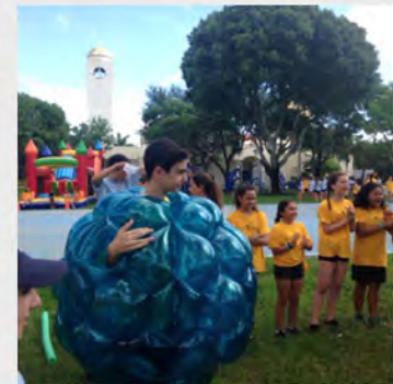
Getting ready for a time-honored Japanese contest of Sumo Wrestling...in a bubble suit!