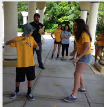
How can we make "Taco Tuesday" an Olympic sport? Taco Jousting! #softshellsareSOMuchbetter!