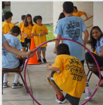
The White and Yellow teams racing in a good old fashioned game of "Mexican Kickball"