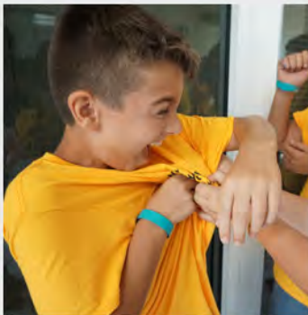
How did Saint Innocent feel on his mission to Alaska? A lot like having ice cubes in your shirt!