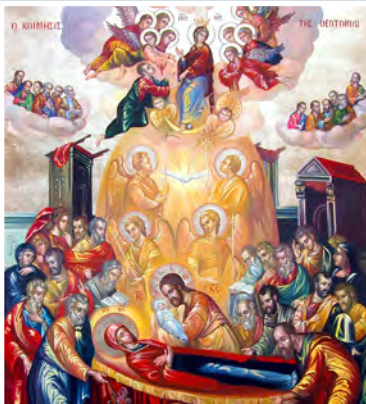
Schedule of Services for Dormition Feast PAGE 4