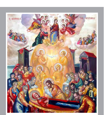
Schedule of Services for Dormition Feast PAGE 3