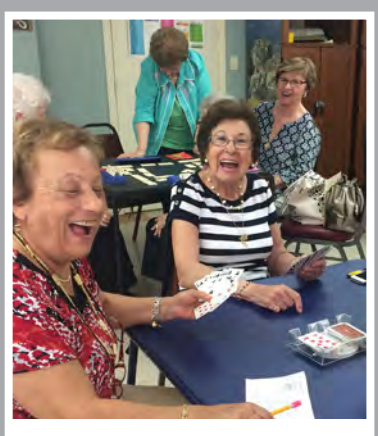
New Senior Game Days are a Huge Hit!